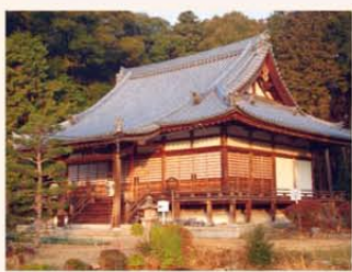
Kannon-ji Temple Omido map17H