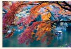
Tinted autumnal Leaves of Arashiyama

Arashiyama is the last stop on the northern cycling route. Known for its picturesque scenery, this was the resort area for noble families during the Heian period and was also mentioned in many Japanese poems and literature. Tourists from all over the country visit Arashiyama for the beautiful cherry blossoms in the spring and autumn leaves in the fall. Enjoy biking around souvenir shops near Togetsu-kyo Bridge, temples and paths in Sagano, etc.