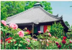
Otokuni dera Temple map7D