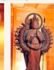
Juhu-ji Temple Kannon Standing Statue map17J

Aotani Bairin (Aotani plum grove) in Joyo City, which is on the right side of the Kizugawa River bank, has beautiful plum blossoms bloom in the spring. If you go just a little south of the Old Nara-kaido Road, you will find Ide-no-Tamagawa which was mentioned in waka poems. It is famous for cherry blossoms and Yamabuki (Japanese Rose). Tachibana-no-Moroe's vacation home was also said to be here. He was one of the authors of Manyo-shu, and was also known as "Ide-no-Sadaijin (Minister of the left)".