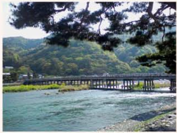
Togetsukyo Bridge map2C