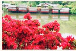
Nagaoka-Tenmangu Shrine Hachijogaikae pond map8C

With beautiful bamboo groves spread throughout the hills on the western side of the Otokuni area, this area is famous for production area of bamboo shoots. There are many burial mounds and historical places such as the Site of Nagaoka Palace, castle ruins from wars of the Sengoku period, and so on. Saigoku Kaido Road stretches from this area to the west, and it runs from Tojiguchi in Kyoto Pref. to Nishinomiya in Hyogo Pref. The old town remains along the Old Saigoku Road.