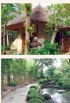
Shokado Garden map13D