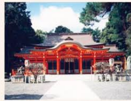
Nagaoka-Tenmangu Shrine map8C