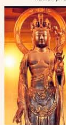
Kannon-ji Temple Standing Statue map17H