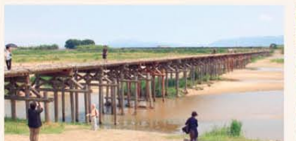
Koduyabashi Bridge (Nagarebashi) map12G